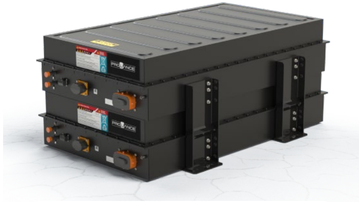
ABS Proliance T700-100