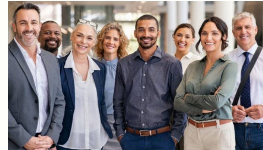
World Class In-house Team