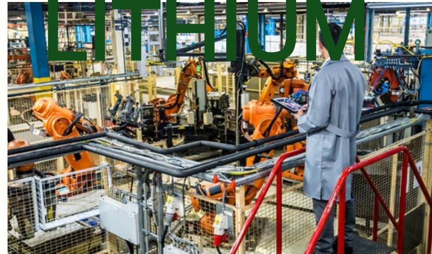
Proven & Strong Technical Partner