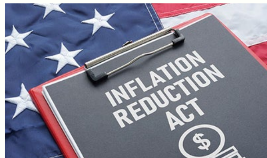
ESG & IRA Compliant