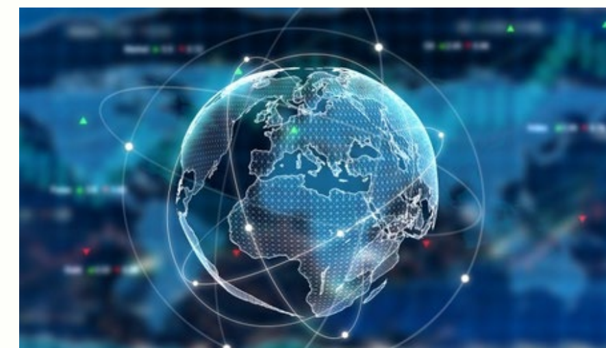
Strategic Global Positioning