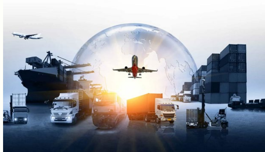
Diversified & Secured Supply Source