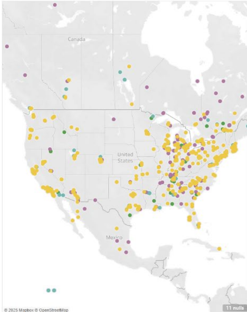
NREL Bat SC - Map