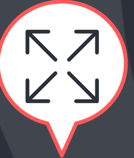
Public company audit