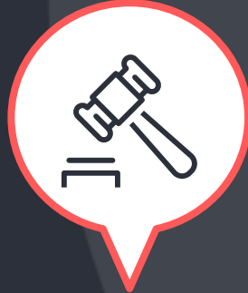
Sarbanes-Oxley (SOX) compliance