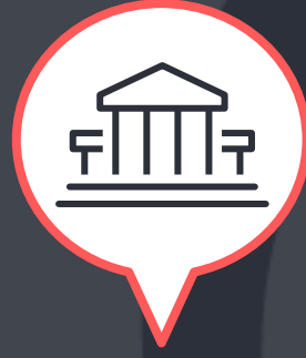
Single audits and federal awards compliance audits