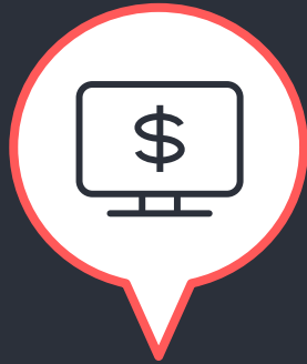
ASC 606 revenue recognition