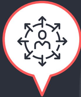
Employee benefit plan audit