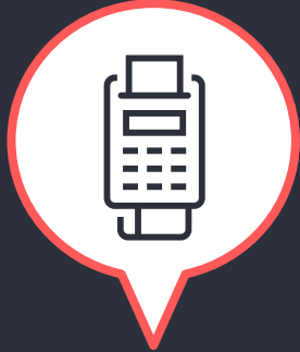
Lease accounting (ASC 842 and GASB 87)