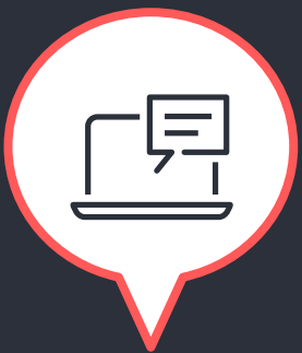
IT audit solutions