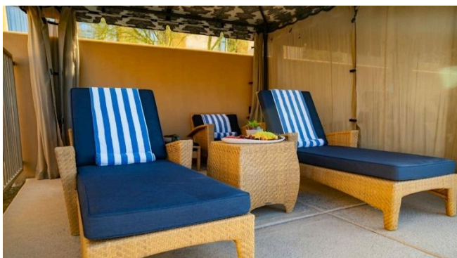
Hashani Spa Cabana

Tuesday, Wednesday and Thursday Activities On-Site at the Starr Pass Resort