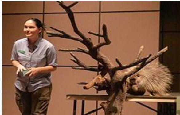
Live Animal Show at the Arizona-Sonora Desert Museum

At 3:00 p.m. participants will meet up outside the main entrance to the Museum to ride back to the JW Marriott Starr Pass Resort. We should arrive back at the Resort by 4 pm to give the spouses and companions some time to relax at the Resort and freshen up before the NAATBatt 2026 Opening Reception in the Resort's Starr Circle area & Foyer from 6 - 7 pm, followed by the NAATBatt 2026 Opening Dinner from 7 – 9:30 pm in the same location. Dress warmly. Nights are cool in the Arizona desert and can drop to temperatures in the 40's Fahrenheit.