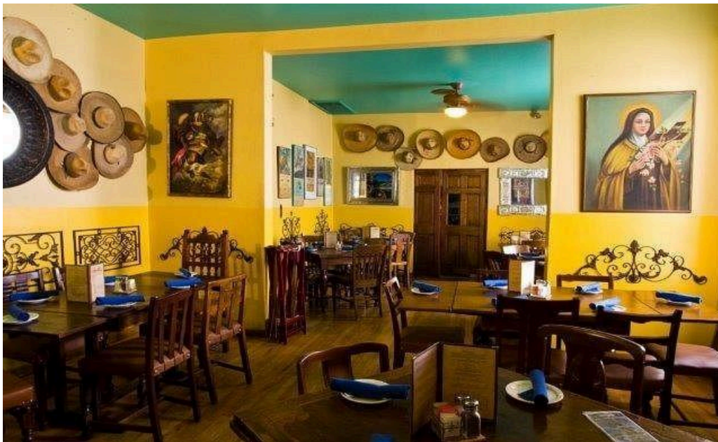
El Charro Cafe, Tucson, AZ

Following a tour of the show, the NAATBatt Spouses & Companions group will gather for lunch a short walk from the Convention Center at El Charro Café , located at 311 N. Court Avenue, Tucson, AZ 85701-1016, ph: 520-622-1922; https://www.elcharrocafe.com/ . El Charro Café is the nation's oldest Mexican restaurant in continuous operation by the same family, known for its authentic Sonoran flavors and signature carne seca tacos.