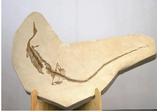
Fossil at Tucson Gem & Mineral Show

Following a tour of the show, the NAATBatt Spouses & Companions group will gather for lunch a short walk from the Convention Center at El Charro Café , located at 311 N. Court Avenue, Tucson, AZ 85701-1016, ph: 520-622-1922; https://www.elcharrocafe.com/ . El Charro Café is the nation's oldest Mexican restaurant in continuous operation by the same family, known for its authentic Sonoran flavors and signature carne seca tacos.