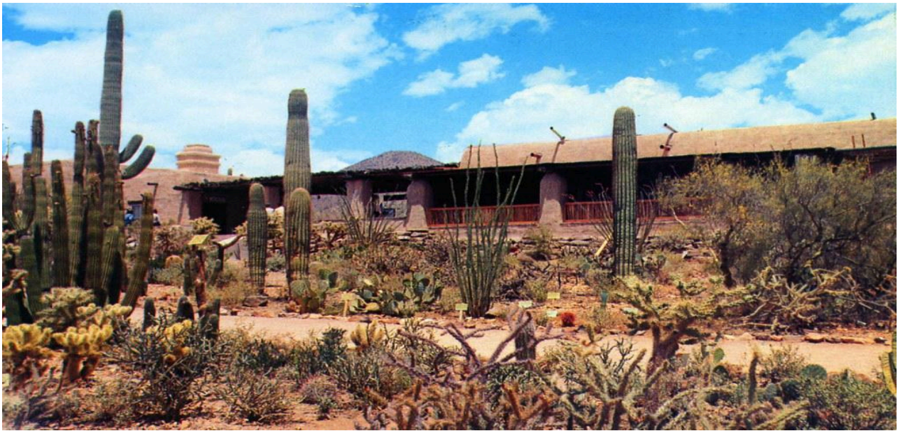
Arizona-Sonora Desert Museum

wear hat, sunglasses, sun screen, comfortable walking shoes and jacket