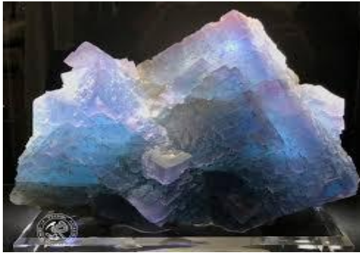
Geode at Tucson Gem & Mineral Show