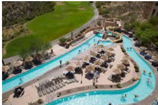
Lazy River Pool

Spouses and companions staying at the JW Marriott Starr Pass Resort will have the option on all days of the NAATBatt 2026 conference to take advantage of the many programs and amenities offered by the Resort, including multi-tiered pools and a lazy river pool, fitness center, hiking and mountain biking trails, lounging, private swim and/or treatments at the Resort's Hashani Day Spa, and 27 holes of meticulously restored to championship-level Arnold Palmer Signature golf courses in a beautiful Sonoran Desert setting. You can book a massage, facial & skincare, body treatment, and manicure or pedicure (excluding dip and acrylic) at the Hashani Day Spa. Spa treatments are limited in number, so book now on-line https://na.spatime.com/ or call: 520-791-6117. Spa facilities are accessible on the day of your scheduled spa treatment. Mention "NAATBatt 2026" when booking to obtain a 10% discount on a spa treatment (excludes salon services). The Spa is closed on Mondays, and its hours are: Tuesday, Wednesday, Thursday: 9:30 – 2; Friday: 9:30 – 4; Saturday 8:30 – 4; and Sunday 8:30 - 3.